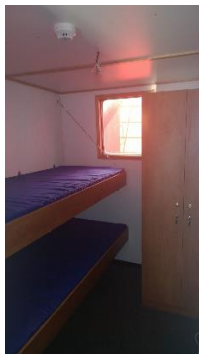
Two man cabin

The vessel has a total of nine beds in 3 single cab and 3 double cabins.